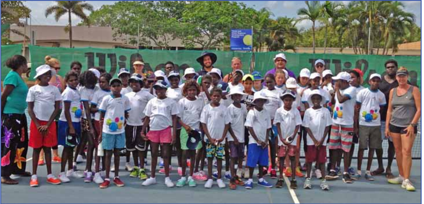
Above: Tennis Gove and Miwatj Healthy Lifestyles Competition in Nhulunbuy, October 15-16th