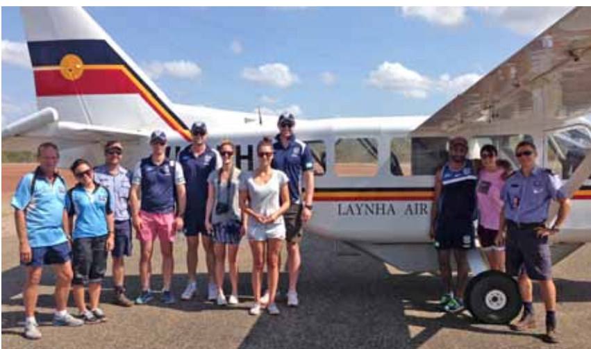
Below: Leaving Gove Airport Bottom right: Sky in Gapuwiyak