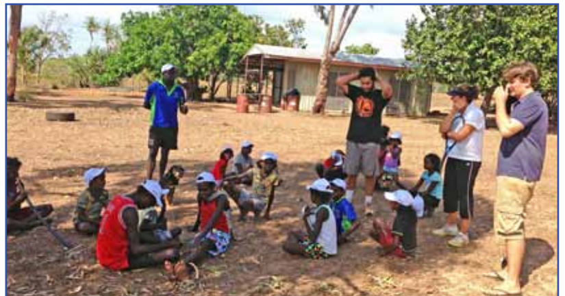
Top (R) HLS Volleyball team at Galuru Right: Community tennis at Ramangirr homelands Below: U15 AFL Carnival in Nhulunbuy