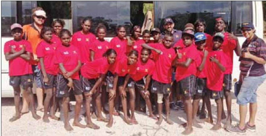
LEFT: Students and staff at the Ngura Program.