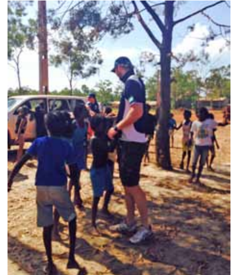
Above left and centre: playing games in Gapuwiyak Top right: Players meet the children Bottom right: In Milingimbi